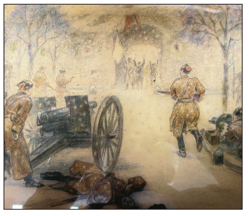
Overtaking the Arsenal in Kyiv by Leonid Perfecky. (Ukrainian Museum and Library of Stamford)

This painting of Vasyl Petruk is the epitome of centuries struggle for freedom for which we are still fighting today - to achieve our nation's permanent freedom and liberty, once and for all.*